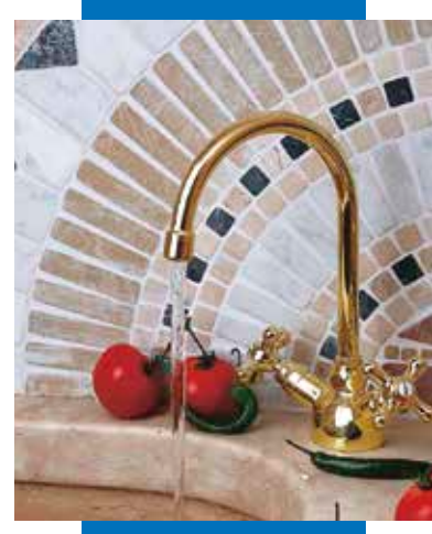
An example of a grouted mosaic tile kitchen