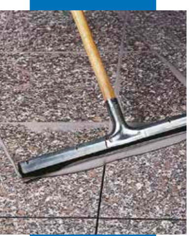
Grouting of pre-smoothened and glossed granite floor with rubber float

to the formation of calcium carbonate and could also be caused by residual moisture contained in adhesives, not fully hydrated grouts, in substrates not adequately dried, or in substrates not adequately protected from rising damp.