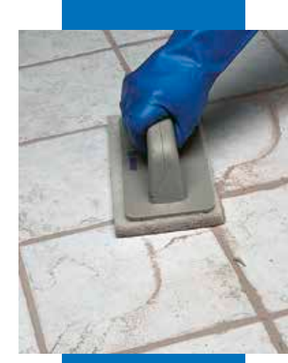
Finishing with a Scotch-Brite® pad