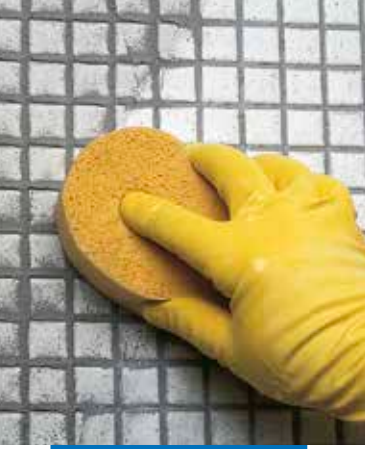
Finishing a glass mosaic with a sponge