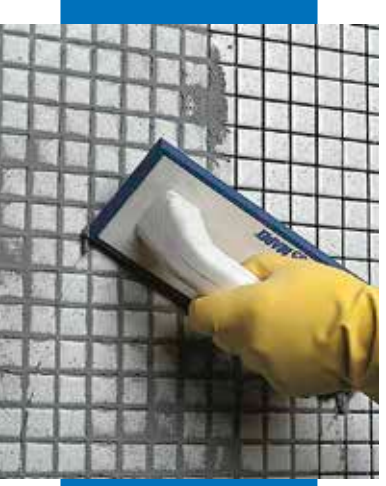
Grouting a glass mosaic (bathroom) with a float