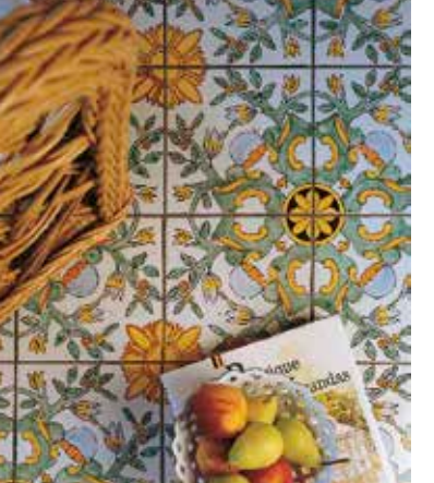
An example of a grouted double-fired tile floor

All relevant references for the product are available upon request and from www.mapei.com.au