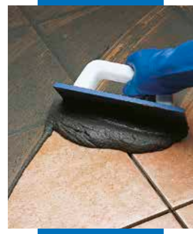
Grouting single-fired tiles with a float