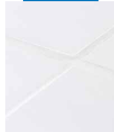
Floor grouted with Kerapoxy Easy Design