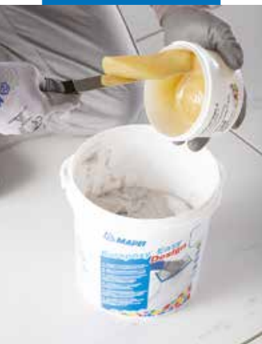
Pour the hardener (component B) in the container of component A