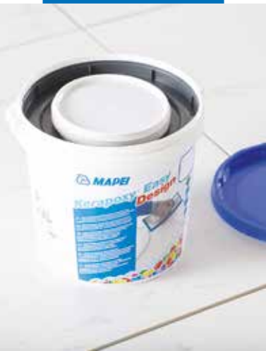
Two-component grout supplied in drums containing both component A and component B