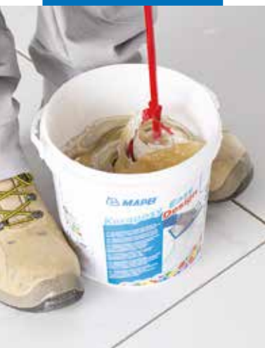
Mix the components (A+B)

workability of the grout/mortar is not affected. When applied correctly, Kerapoxy Easy Design produces joints with the following characteristics: